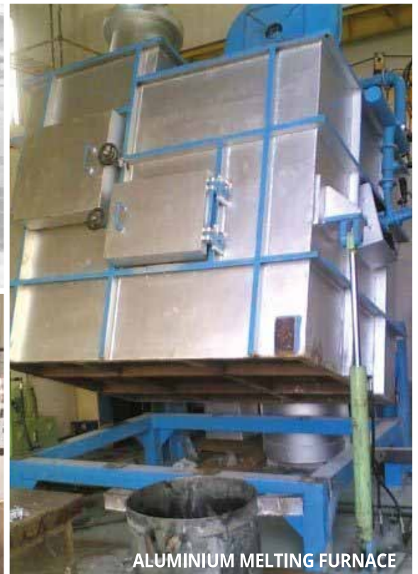
ALUMINIUM MELTING FURNACE