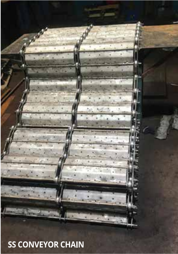
SS CONVEYOR CHAIN