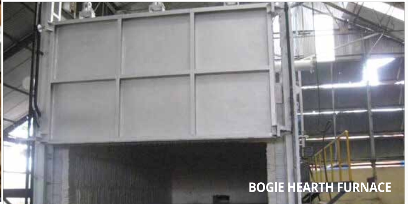
BOGIE HEARTH FURNACE