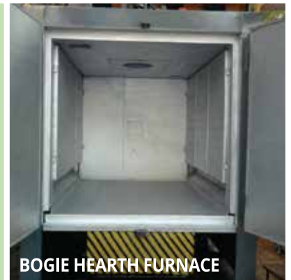
BOGIE HEARTH FURNACE