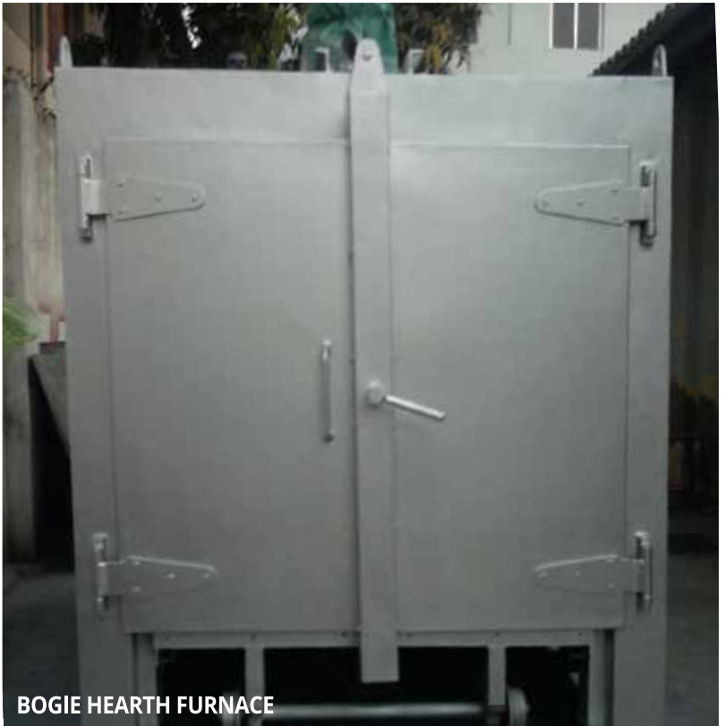
BOGIE HEARTH FURNACE