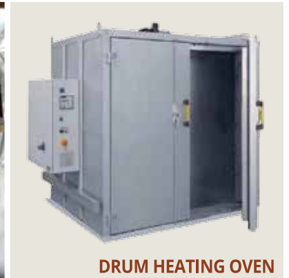
DRUM HEATING OVEN