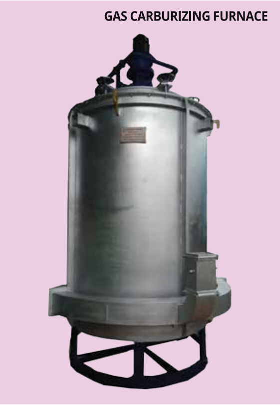
GAS CARBURIZING FURNACE