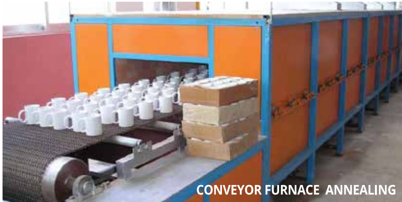
CONVEYOR FURNACE ANNEALING