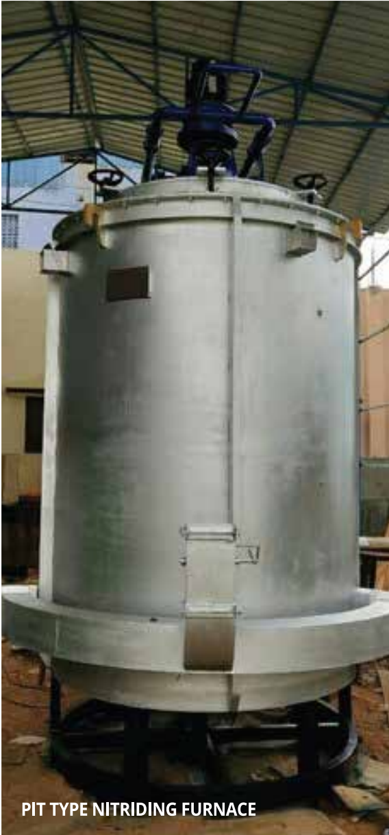
PIT TYPE NITRIDING FURNACE