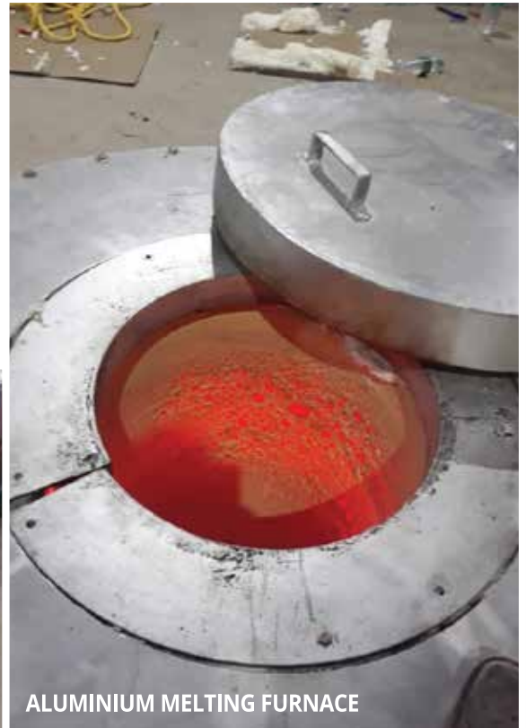
ALUMINIUM MELTING FURNACE