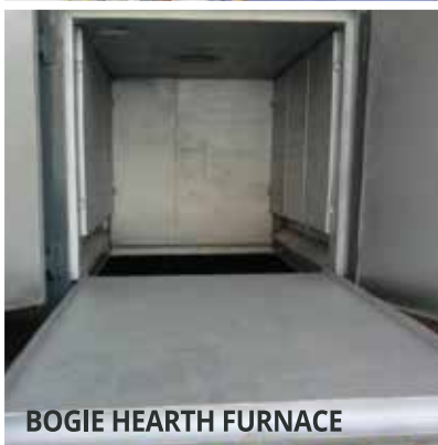
BOGIE HEARTH FURNACE