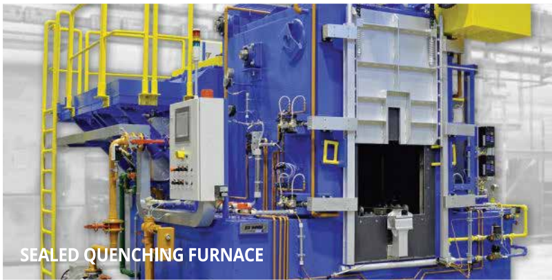
SEALED QUENCHING FURNACE