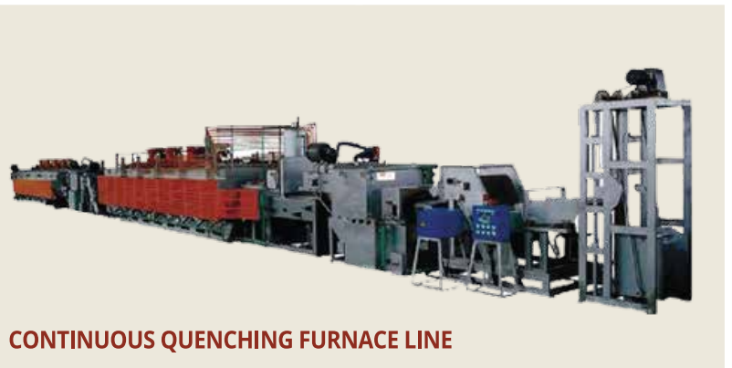
CONTINUOUS QUENCHING FURNACE LINE