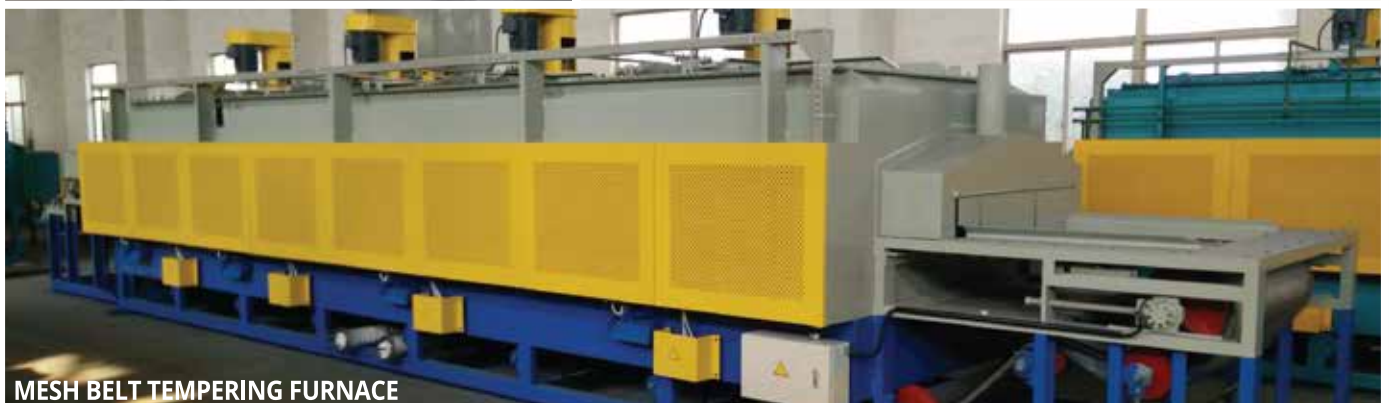
MESH BELT TEMPERING FURNACE